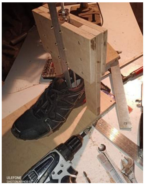
Shoe measurement device built for Finland – Sweden match.

The main responsibility of organizing FIN-SWE match fell to the local club Tampereen Pyrintö. They have a lot of competent officials due to having staged many major competitions in recent years, including the U20 Word Championships 2020 and U23 European Championship 2013. The majority of officials were locals and some additions were invited from the list of national officials (NTO's). In Finland the national federation lead training programs for both NTO's and competition directors. Both trainings are held over this weekend and also included a final examination.